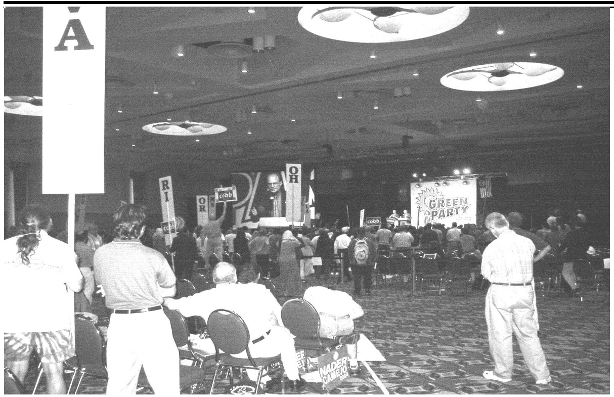
Forward 2004! At the Green Party National Convention in Milwaukee.